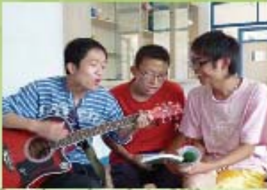
Counselors rock out during 2009 summer camp.

Home study, blood tests, I-800A, Fingerprints, embassy, wait another day; Medicals, notary, salary, net worth, I never thought I'd spend 3 weeks just proving my own birth!