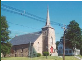
Kirkpatrick Memorial Presbyterian Church