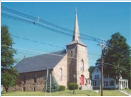
Kirkpatrick Memorial Presbyterian Church