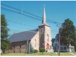
Kirkpatrick Memorial Presbyterian Church