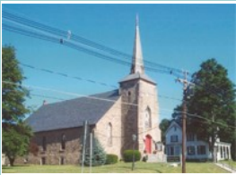
Kirkpatrick Memorial Presbyterian Church