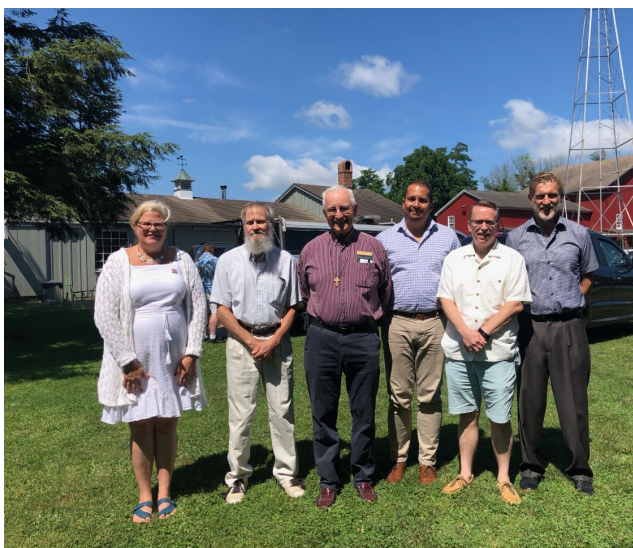
Community Worship Day Clergy

If you are showing symptoms of illness or have a temperature of over 100.4, please stay home out of concern and love for all.