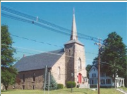
Kirkpatrick Memorial Presbyterian Church