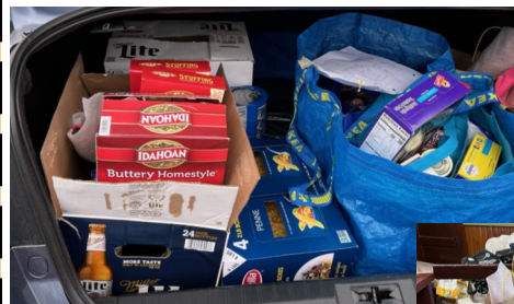
Donations from Living Waters Lutheran Church for Thanksgiving Baskets